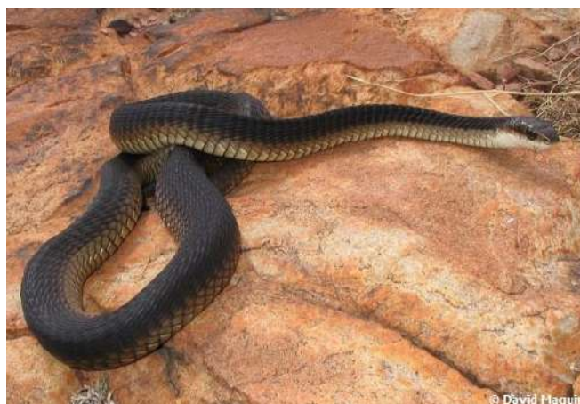
Boomslang (swart, volwasse)