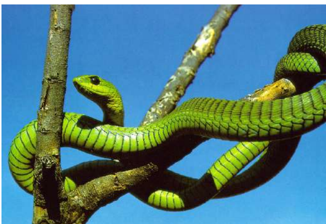
Boomslang (groen, volwasse)